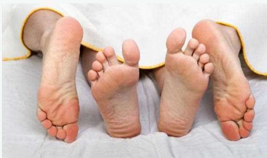
Pheromones Human Pheromones Androstenone Buy Human Pheromones Attract