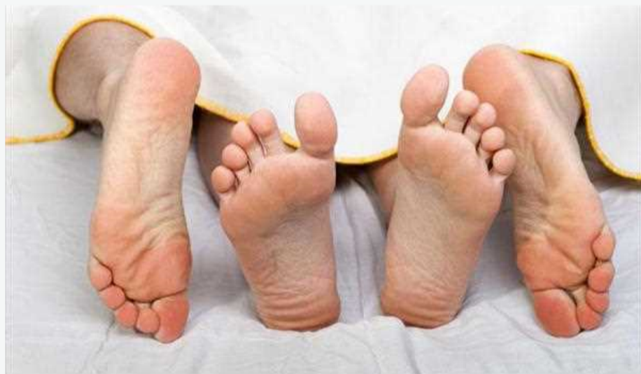
Pheromones Human Pheromones Androstenone Buy Human Pheromones Attract