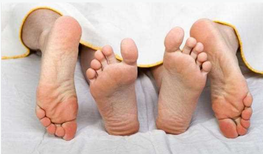
Pheromones Human Pheromones Androstenone Buy Human Pheromones Attract