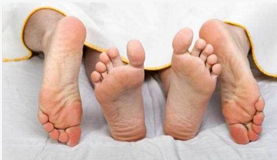
Pheromones Human Pheromones Androstenone Buy Human Pheromones Attract