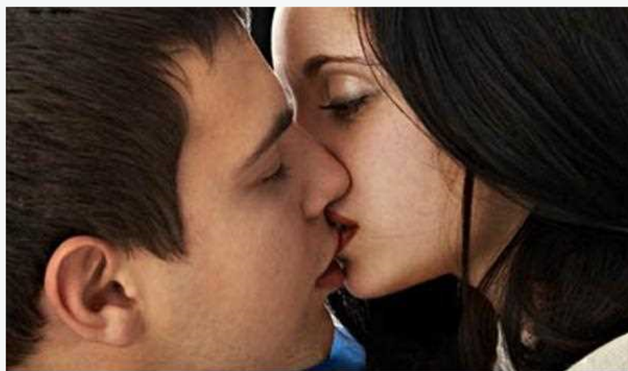
PheromonesA314Pheromone ProductPheromone ColognesPheromone