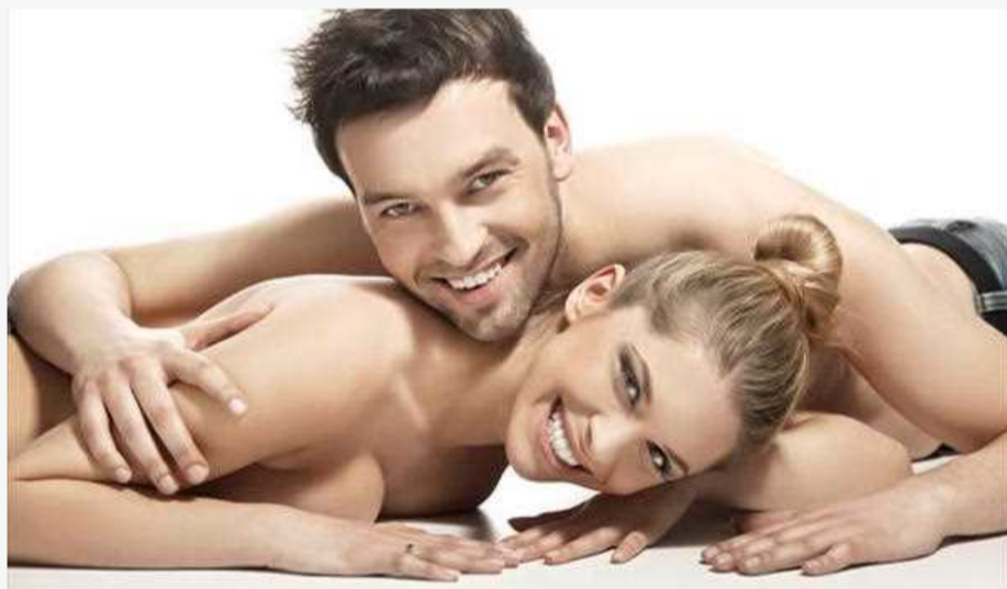
Pheromones Attracting Women Secret Weapon

When making a decision while using group or perhaps when flirting with the girl you want, be decisive together with what you are saying. Make concrete floor statements about how things are and how you feel about these. Do not attempt to please everyone there by going in addition to what they are saying. Be your own confident person and be decisive about what you want. Women is going to be drawn to this and it will be easier for you to get to be the alpha male.