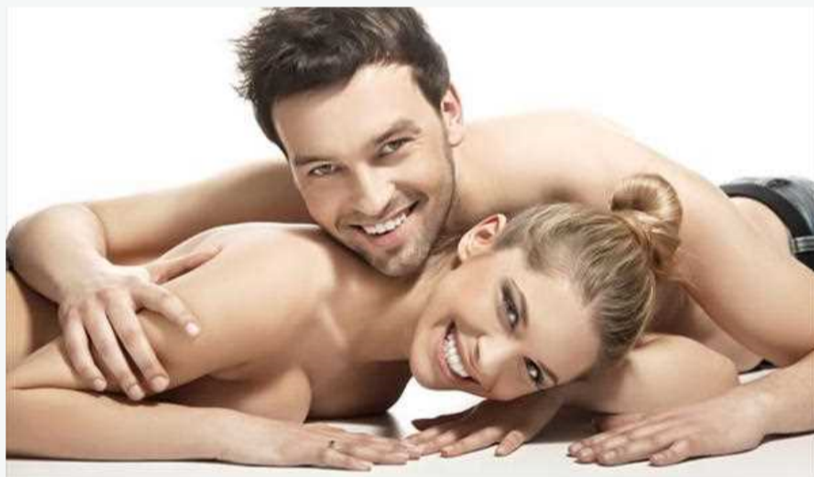
Pheromones Attracting Women Secret Weapon

When making a decision while using group or perhaps when flirting with the girl you want, be decisive together with what you are saying. Make concrete floor statements about how things are and how you feel about these. Do not attempt to please everyone there by going in addition to what they are saying. Be your own confident person and be decisive about what you want. Women is going to be drawn to this and it will be easier for you to get to be the alpha male.