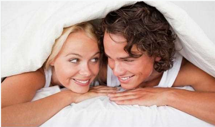
Pheromones Best Pheromone Pheromone Reviews Attracting

Alpha-7 Scented: One of my favorite pheromones, Alpha-7 has a spicy cinnamon scent. I've had some amazing encounters along with women who have shown a strong interest in getting to know me. In contrast to some of the other pheromones I've used, Alpha-7 tends to last longer with each dose being effective for 4-6 hrs. This stuff is concentrated and packs 40% more pheromone than most of its competitors.