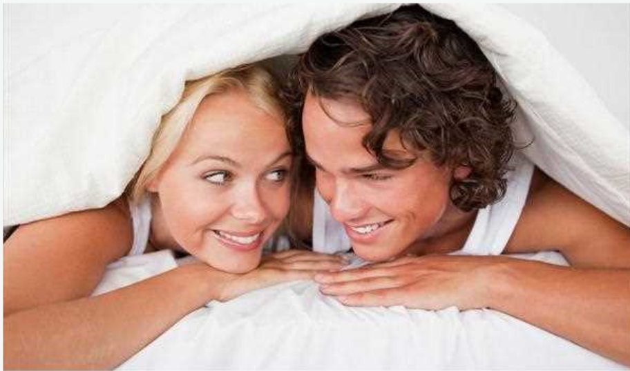
Pheromones Best Pheromone Pheromone Reviews Attracting

Alpha-7 Scented: One of my favorite pheromones, Alpha-7 has a spicy cinnamon scent. I've had some amazing encounters along with women who have shown a strong interest in getting to know me. In contrast to some of the other pheromones I've used, Alpha-7 tends to last longer with each dose being effective for 4-6 hrs. This stuff is concentrated and packs 40% more pheromone than most of its competitors.