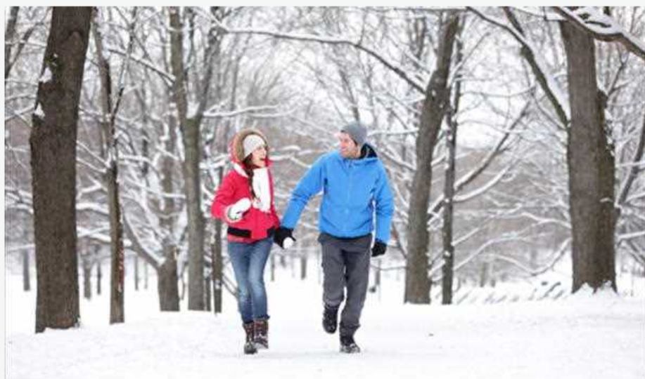
PheromonesPheromone SpraysHuman Sweat

The person who brings the enterprise world in spite of of lesser qualities, they both create pheromones more than average or use them as a supplement. If you want to achieve success in your business, you can give business pheromone perfumes an attempt.