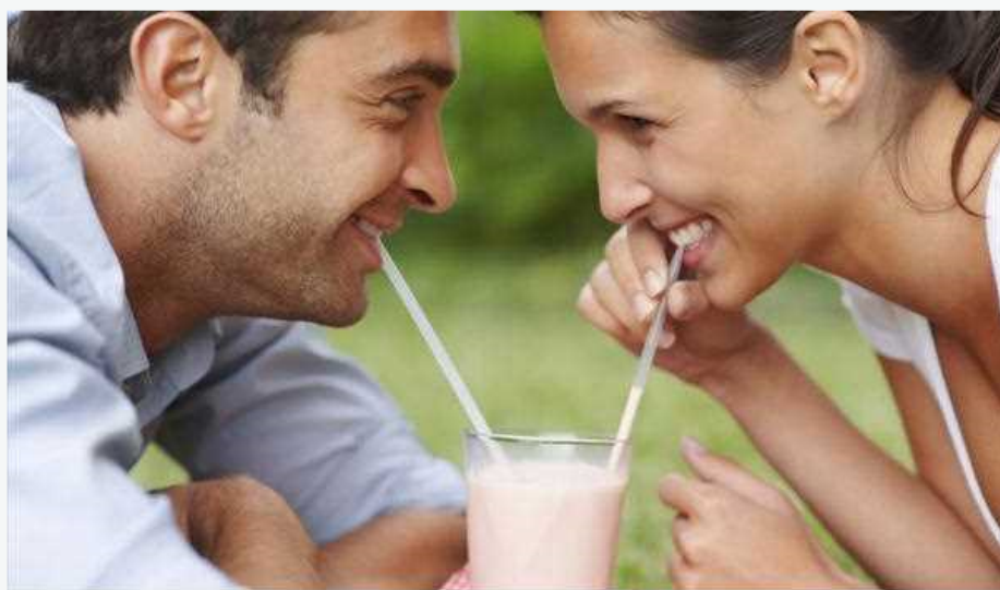
Social Interaction Pheromones Chemical Compounds

However, there isn't any definitive scientific data about the effectiveness of using topical applications of human hormones to be able to influence members of the opposite sex within social discussion. The release of hormones is known to happen, but whether or not they last long enough to be appropriate in a perfume or cologne, or regardless of whether using hormones that actually belong to another may help is not known. Testimonial evidence is too subjective to be considered scientific proof, but it can still be powerful to those who are interested in these products.