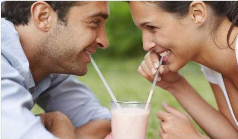
Social Interaction Pheromones Chemical Compounds

However, there isn't any definitive scientific data about the effectiveness of using topical applications of human hormones to be able to influence members of the opposite sex within social discussion. The release of hormones is known to happen, but whether or not they last long enough to be appropriate in a perfume or cologne, or regardless of whether using hormones that actually belong to another may help is not known. Testimonial evidence is too subjective to be considered scientific proof, but it can still be powerful to those who are interested in these products.