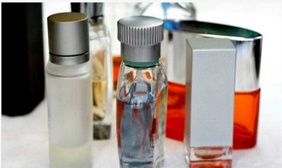
Pheromone Cologne Pheromones Physical Attraction Pheromone

Your level of confidence, dreams, wishes and the urge to have physical contact with the woman you think will be happy with this unique pheromone cologne. There is a variety of pheromone to suit your needs, like, spray, cologne, scented, unscented, mist etc. It has immensely helped to create strong bodily relationships too has improved the level of intimacy to be able to attain the peak while performing the particular lovemaking act. It has additionally helped a lot of people who lack in libido or have any sort of sex deficiency since pheromone triggers your hormones that play major role in arousing your partner as well as yourself.