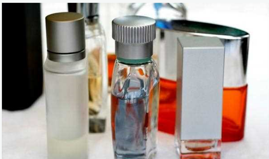
Pheromone Cologne Pheromones Physical Attraction Pheromone

Your level of confidence, dreams, wishes and the urge to have physical contact with the woman you think will be happy with this unique pheromone cologne. There is a variety of pheromone to suit your needs, like, spray, cologne, scented, unscented, mist etc. It has immensely helped to create strong bodily relationships too has improved the level of intimacy to be able to attain the peak while performing the particular lovemaking act. It has additionally helped a lot of people who lack in libido or have any sort of sex deficiency since pheromone triggers your hormones that play major role in arousing your partner as well as yourself.