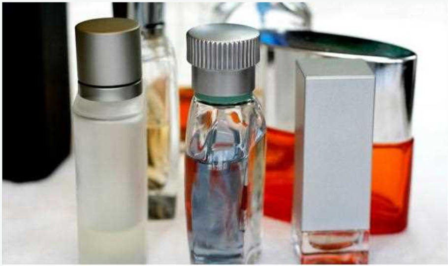
Pheromone Cologne Pheromones Physical Attraction Pheromone

Your level of confidence, dreams, wishes and the urge to have physical contact with the woman you think will be happy with this unique pheromone cologne. There is a variety of pheromone to suit your needs, like, spray, cologne, scented, unscented, mist etc. It has immensely helped to create strong bodily relationships too has improved the level of intimacy to be able to attain the peak while performing the particular lovemaking act. It has additionally helped a lot of people who lack in libido or have any sort of sex deficiency since pheromone triggers your hormones that play major role in arousing your partner as well as yourself.