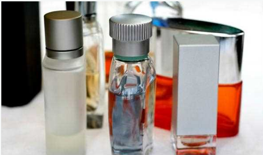
Pheromone Cologne Pheromones Physical Attraction Pheromone

Your level of confidence, dreams, wishes and the urge to have physical contact with the woman you think will be happy with this unique pheromone cologne. There is a variety of pheromone to suit your needs, like, spray, cologne, scented, unscented, mist etc. It has immensely helped to create strong bodily relationships too has improved the level of intimacy to be able to attain the peak while performing the particular lovemaking act. It has additionally helped a lot of people who lack in libido or have any sort of sex deficiency since pheromone triggers your hormones that play major role in arousing your partner as well as yourself.