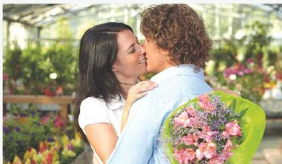
PheromonesPheromone PerfumeSex PheromonesPheromones

Who different desires to receive the best package about the best pheromone fragrance and also cologne?