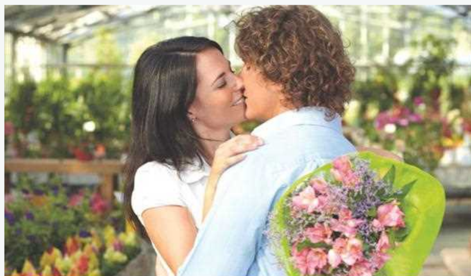
PheromonesPheromone PerfumeSex PheromonesPheromones

Who different desires to receive the best package about the best pheromone fragrance and also cologne?