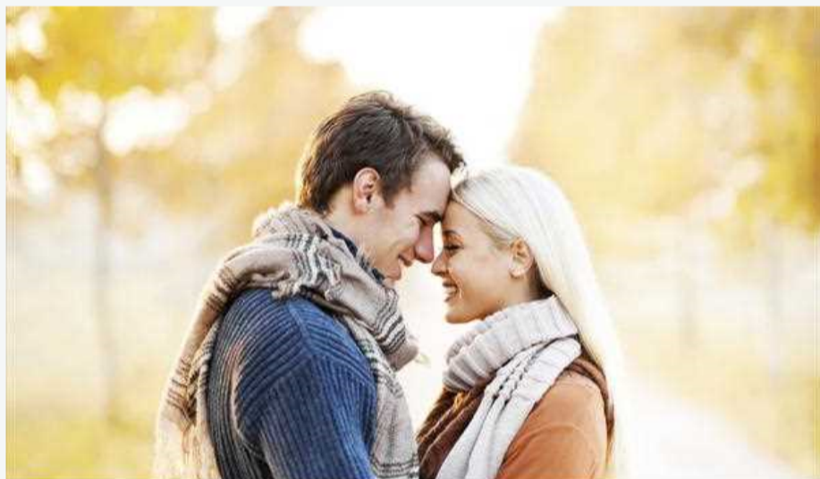
Pheromone Cologne Pheromones Pheromone Product Reviews Pheromone