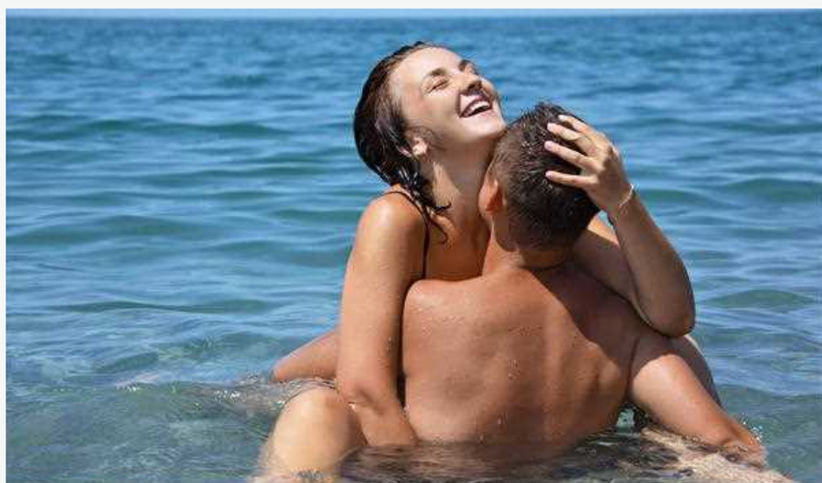
PheromonesSexual AttractionHuman BodyPheromones ColognePheromonesAndrostenone

Man made artificial pheromones generally have the same basic method and also the difference lies in the quality of elements used. It is very important to use cologne that has a high portion of pheromones in it. These kinds of pheromones are not very cheap so one should check up these products top quality and also status thoroughly before going ahead with the purchase.