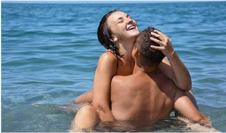
PheromonesSexual AttractionHuman BodyPheromones ColognePheromonesAndrostenone

Man made artificial pheromones generally have the same basic method and also the difference lies in the quality of elements used. It is very important to use cologne that has a high portion of pheromones in it. These kinds of pheromones are not very cheap so one should check up these products top quality and also status thoroughly before going ahead with the purchase.