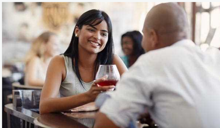
PheromonesPheromones PerfumeHuman Pheromones