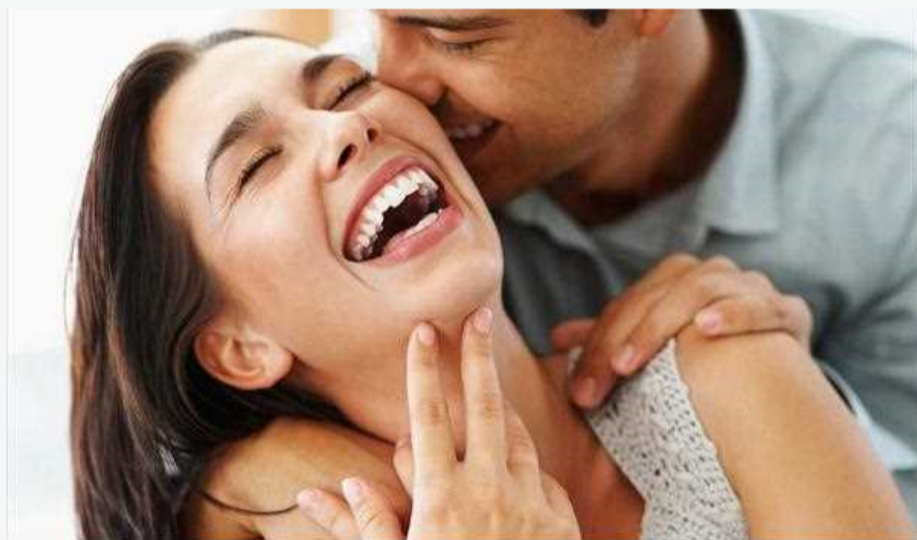
Pheromones Pheromone Cologne

Sometimes regarding some of those partnerships if the chemistry didn't totally make it to the degree of atomic bomb, pheromones can go considerably inside developing which chemical relationship that many people desire. Why don't we admit it, as people we all are actually a symbiotic types. Most of us desire one another for a number of causes but the most significant issue is the fact that people are designed for partnerships. Everyone want to relate on a romantic level along with another personal, a passionate close relationship can be the deepest of such relationships. That being the case, wherever achievable we need to have that connection grow to be as heavy as well as significant as possible. A lot of us, put simply, want the whole package.