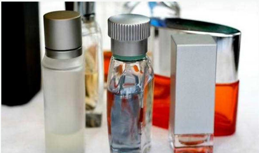
Pheromone Cologne Pheromones Pheromone Colognes Pheromone

Wearing a pheromone cologne instills a breeze of confidence in the person putting on the cologne. However, it is also not good to be able to have too much confidence in you. Don't you ever think that if you walk in the middle of the lime light, in the midst of a beautiful and handsome crowd, people will notice you instantly. The main function of a pheromone cologne will be to help you have a sense of confidence in you. It will help you feel good about yourself and create an impression that you are an attractive person. When you get the heat, continue to create a good impression and let them notice you and eventually get attracted to you. Mingle in the event that you must. Have conversations with different kind of people and get those pheromones going.