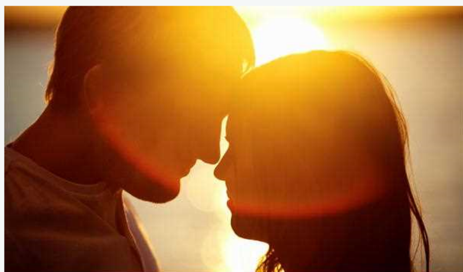
Pheromone Cologne Attract Others Pheromones Human Pheromones Physical