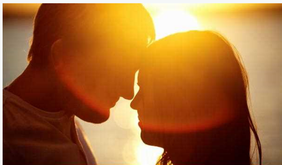
Pheromone Cologne Attract Others Pheromones Human Pheromones Physical