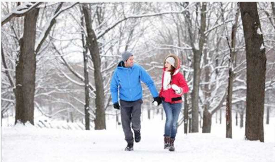
PheromonesSexual AttractionAttract WomenPheromone ProductSeductionAndrostenoneSex

The other one is the pheromone for male's androstenone is the male man pheromone helps attract women . A mans human pheromone perfumes when smelled with a women will be the most powerful attractant that a man can present to draw in or perhaps attract a ladies.