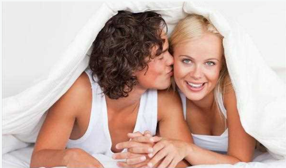
PheromonesSexual AttractionMale PheromonesSex Pheromones

The sense of smell in humans is what can be used when sensing pheromones. We take a great deal of time to eliminate our body odors. We all remove them by taking a bath, using deodorants, applying skin lotions, or perfumes. All of these mask the aroma that is obviously on our skin.