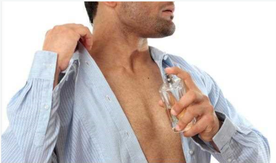
Pheromones Sexually Attractive Human Pheromones Attract

Science is very capable of working like miracles, and since that time the function of these human pheromones came to light, the obvious question popped up. Can humans control them? Well, the answer is yes. If your body is not releasing a sufficient amount of these chemicals, why not put some of them on. Therefore, the advent of the pheromone cologne came to be, or the pheromone perfume in the case of women.