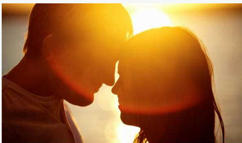
PheromonesDating SceneHuman PheromonesPherazonePheromone

Womens pheromones typically include a great pheromone articles called copulins. Copulins are most often found in women pheromone perfume to increase the amounts of attraction in men. Men find these fragrances to be many amazing and are literally drawn in order to women in such intriguing and attractive of ways.