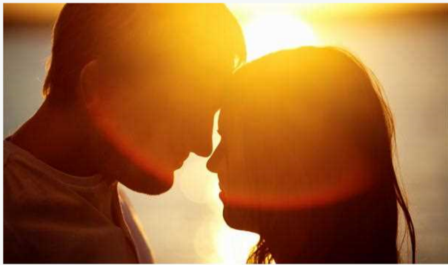
PheromonesDating SceneHuman PheromonesPherazonePheromone

Womens pheromones typically include a great pheromone articles called copulins. Copulins are most often found in women pheromone perfume to increase the amounts of attraction in men. Men find these fragrances to be many amazing and are literally drawn in order to women in such intriguing and attractive of ways.