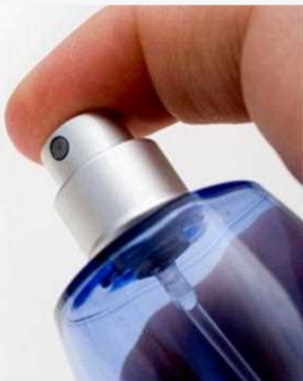
Pheromones Pheromone Colognes Pheromone Cologne Pheromones

When used in a large abundance, pheromones colognes will work against you. You should limit your own in-take, which means only take a few small dabs each time. These types of fragrances have strong scents and really powerful pheromones. When you go crazy and use a ton of cologne, the cologne overpowers women and in actual fact makes them want to get as from an individual as it can be.