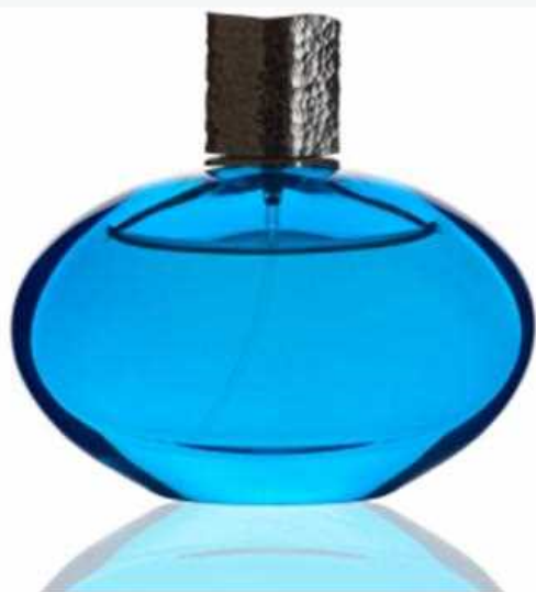
PheromonesNexus PheromonesPhysical AttractionPheromones

Popular case of pheromone use involves the McClintock effect, in which women pheromones tend to be said to result in a special response in other women, such as their menstrual cycles.