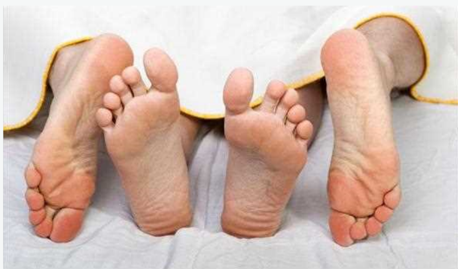
PheromonesPheromone ProductsHuman PheromonesPheromone

Many researchers have concluded that this is not only because of a man's knowledge with words, but also because of their heightened levels of pheromones, while some other men who secretes lesser levels of pheromones usually fails inside attracting a partner.