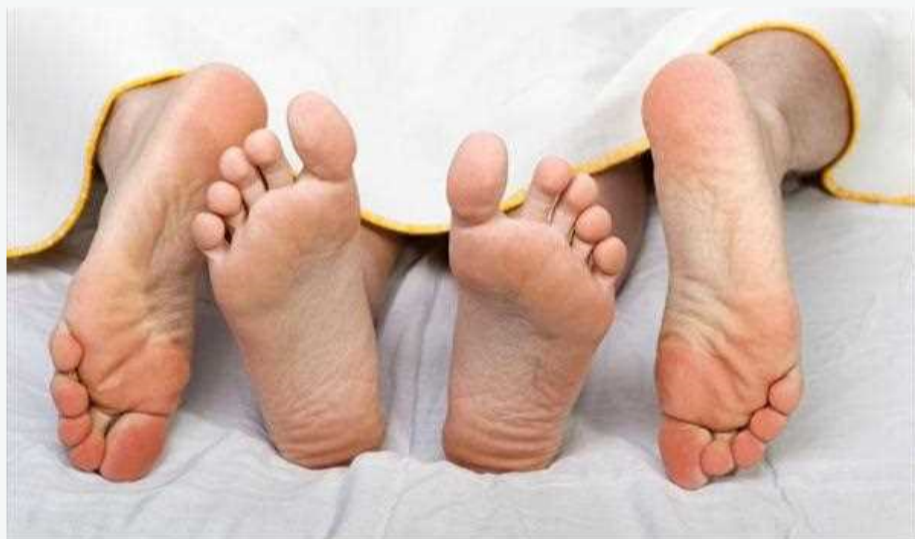
PheromonesPheromone ProductsHuman PheromonesPheromone

Many researchers have concluded that this is not only because of a man's knowledge with words, but also because of their heightened levels of pheromones, while some other men who secretes lesser levels of pheromones usually fails inside attracting a partner.