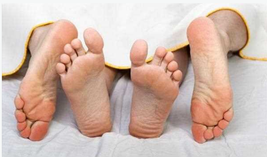
Pheromones Pheromone Products Human Pheromones Pheromone

Many researchers have concluded that this is not only because of a man's knowledge with words, but also because of their heightened levels of pheromones, while some other men who secretes lesser levels of pheromones usually fails inside attracting a partner.