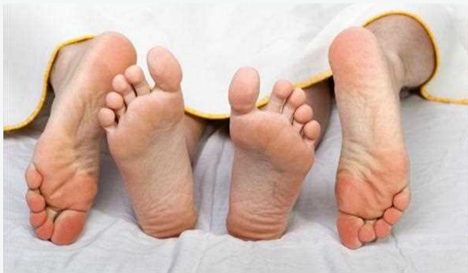
Pheromones Pheromone Products Human Pheromones Pheromone

Many researchers have concluded that this is not only because of a man's knowledge with words, but also because of their heightened levels of pheromones, while some other men who secretes lesser levels of pheromones usually fails inside attracting a partner.