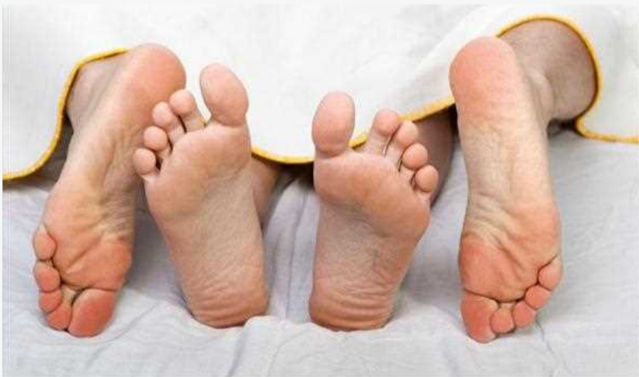
Pheromones Pheromone Products Human Pheromones Pheromone

Many researchers have concluded that this is not only because of a man's knowledge with words, but also because of their heightened levels of pheromones, while some other men who secretes lesser levels of pheromones usually fails inside attracting a partner.