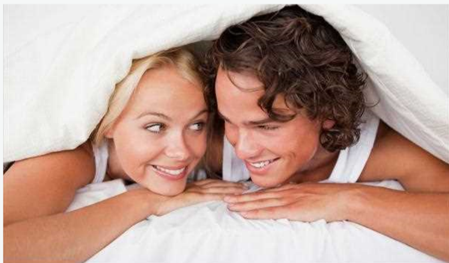
Attract Women Pheromones Women Attractor Seduction