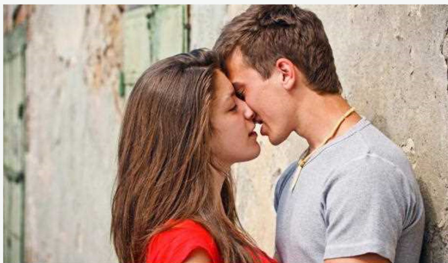
Pheromone Scent Attract Women Pheromones Natural Pheromones Unfair

Of course, this is not entirely the truth with the human animal, which does not only mate for survival of the species, but also for pleasure. For this reason, people can learn to use the pheromone scent in order to draw members of the opposite sex to them. This is actually a practice that has been used for a very long time, and is commonly understood to be the major principle behind colognes and perfumes, which is now somewhat necessary since the perfuming of soaps and detergents may have hindered a chance to readily identify the natural hormones of another person.