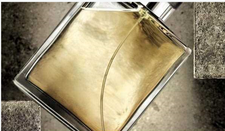
Pheromones Social Situations Social Interaction Sex Pheromone Pheromone