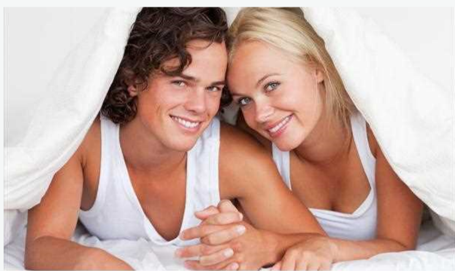
Male Pheromone Ice

“ The truth about his chemical existing in the organisms was proved by German scientists in the year 1956. They will identified the phenomena in animals and insects and so silkworm has been there initial target. From then on the research took place among females and then males, thus it was finally explained which pheromones existed in every human being and also animal.